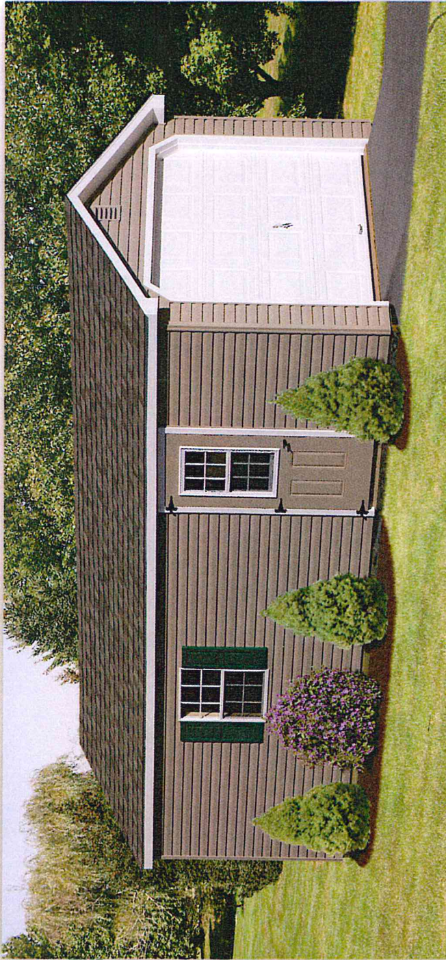
A-Frame Garage 30"x36" Window with Panel Shutters, Clay Man Door with Operable Window, 8" Overhang Above Garage Door